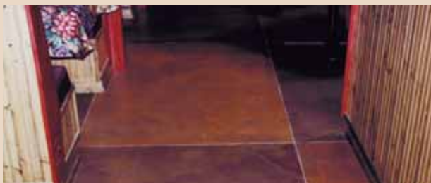
Mottled two colour with saw cut design