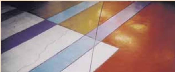
Saw cut designs with multi-colour stain