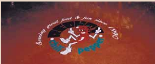
EPOXAL Stain with an incorporated logo