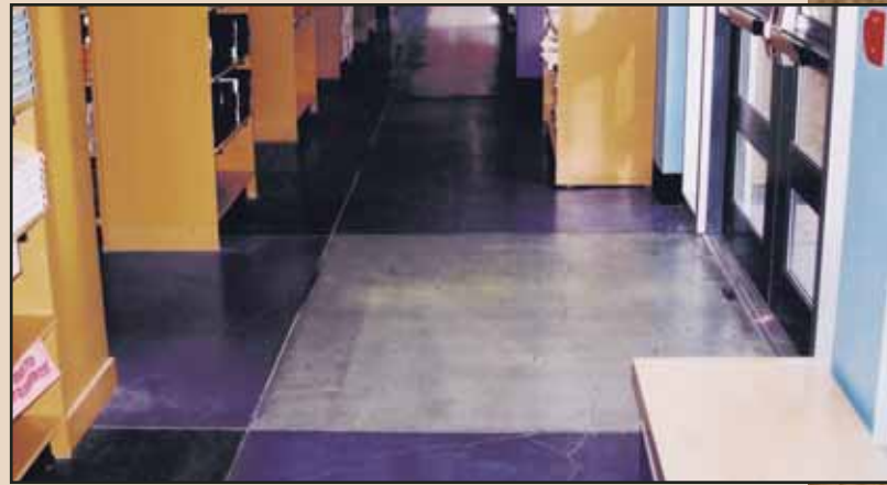
University book store with multi-colour design