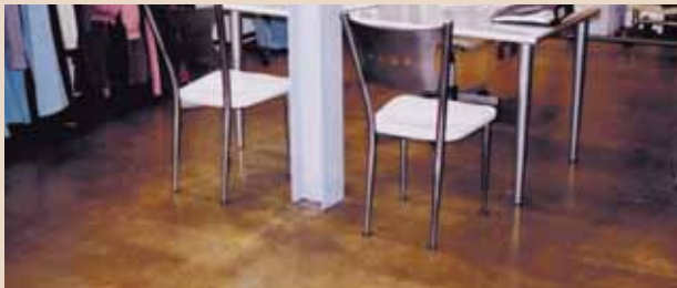
The look of old patina

NPC offers a wide variety of decorative techniques using EPOXAL Stain. A few of the possibilities are shown below. The variations are limited only by your imagination.