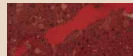
10% Coral Red with filled crack

Cracks in the substrate can be left alone or filled. The filled crack will appear as a different shade.