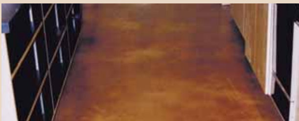
NPC EPOXAL clear over an acid stained floor