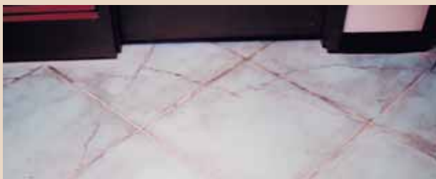
Ceramic tile pattern