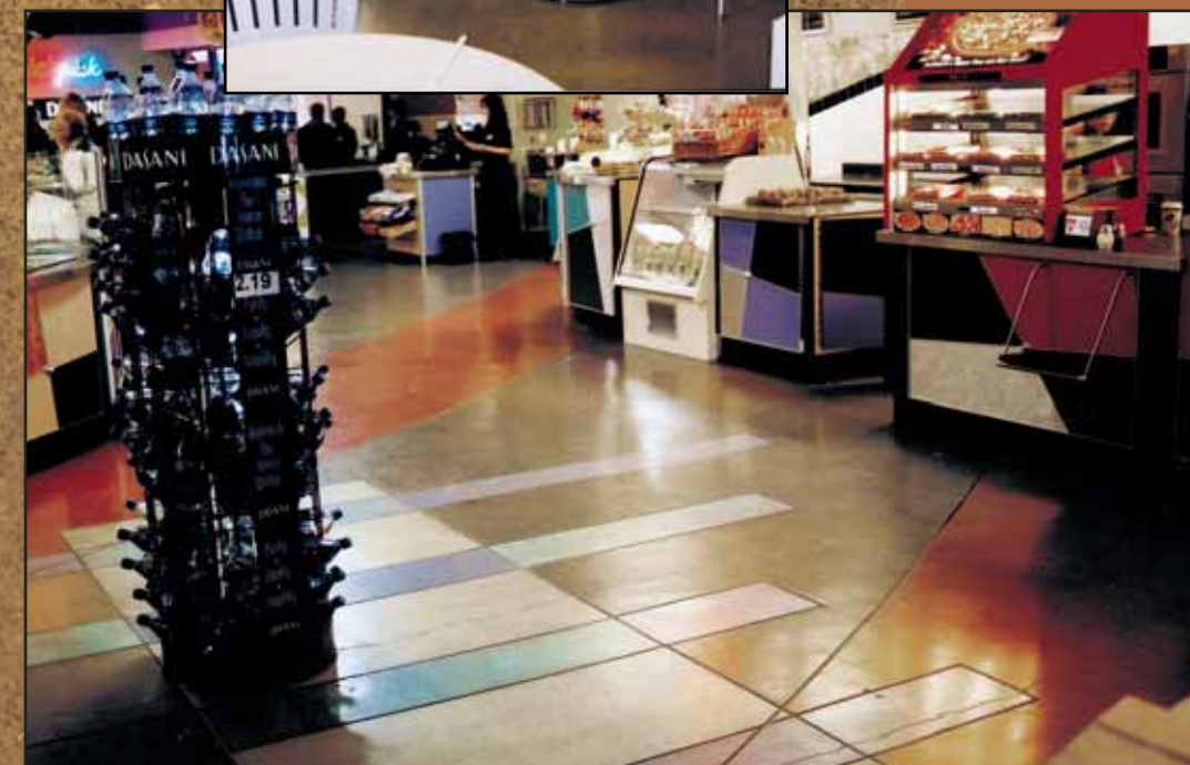
Top: Kitchen floor with a saw cut tile pattern Centre: Cafeteria floor Bottom: Food court with saw-cut designs and multi-colour Background sample: 10% Golden Spice